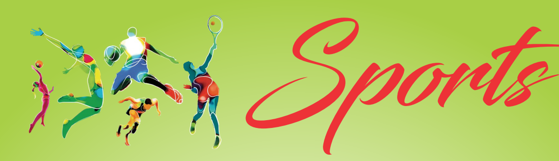
Table Tennis Matches, FURC

In the prevailing COVID-19 situation an interesting tournament of table tennis was arranged by the Sports Society on 05 October, 2020 FURC in order to stimulate mental alertness, concentration and develop mental acuity